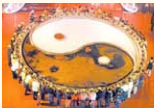
Biggest Hot Pot in the Guinness world record

Key tourist attractions include UNESCO World Heritage sites such as the 9th century Dazu Rock Carvings , Three Gorges in Yangtze River, Jiuzhai valley , and ancient village of Ci Qi Kou (Porcelain Village). Stopover in Xian (1 hour flight from Chongqing) to visit the world famous Terracotta Warriors , or Beijing (2 hours flight from Chongqing).