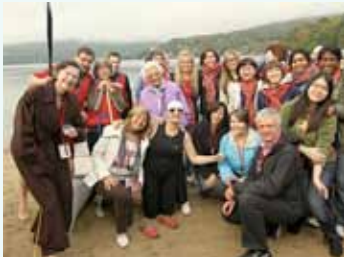
The Canadian Olympians after winning the Royal dragon boat competition.