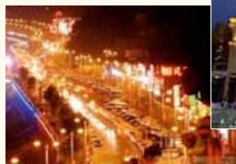
Food street next to Sheraton hotel