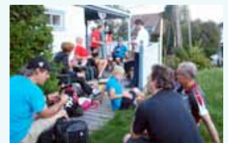
...and relaxing (some more than others) at the end of the first day!

On the following day, a courageous group of ISCYCLISTS (22 participants) joined together for a 3 day-300 km ride in the Laurentians (north of Montreal) that was enjoyed (ride, food, drink and scenery) by all the participants.