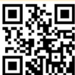
QR Code for the ISCEV website