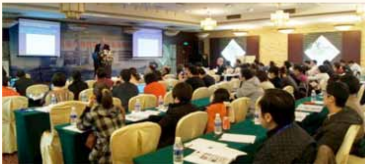
During the lecture.

About 140 ophthalmologists and vision researchers from different major hospitals and institutions in China attended the training course. Through the training, many participants said that they have realized the importance of ERG, acquired basic knowledge and broadened their view. Some young people expressed that the course has inspired their enthusiasm and would consider taking visual electrophysiology as their career.