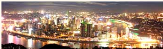
Night View of Chongqing City