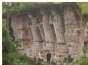
Dazu Rock Carvings

Convenient access to Chongqing International Airport with non-stop international flights from Tokyo, Nagoya, Seoul, Singapore and Bangkok.