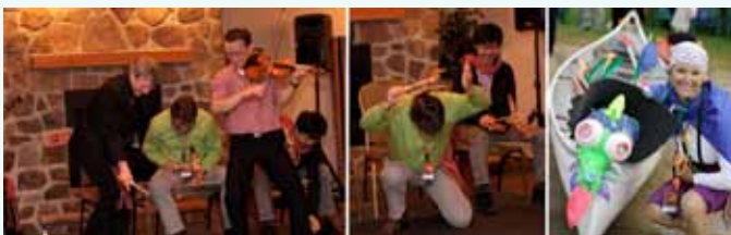
Presidents at work!