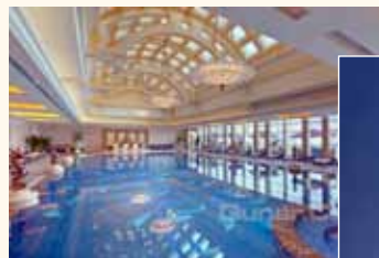
Swimming pool in the hotel

The conference hotel located at the famous food street, facing Yangtze River and CBD. Please enjoy the delicious Sichuan cuisine and beautiful night view! Despite the world-class standards, the cost of hosting conferences is only half of other major Asian cities . This ensures a low registration fee for all delegates with great food and social activities .