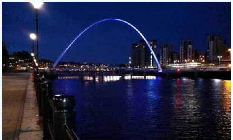
Newcastle's Millennium Bridge – the 'blinking eye'.

An educational course prior to the symposium again proved very popular. The topic was "Unexplained Functional Visual Loss". It included two excellent lectures given by local experts from the Ophthalmology Dept. Royal Victoria Infirmary,