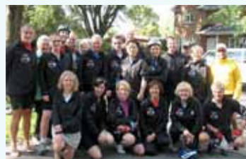
The joyful 2011 ISCYCLISTS minutes prior to departure.